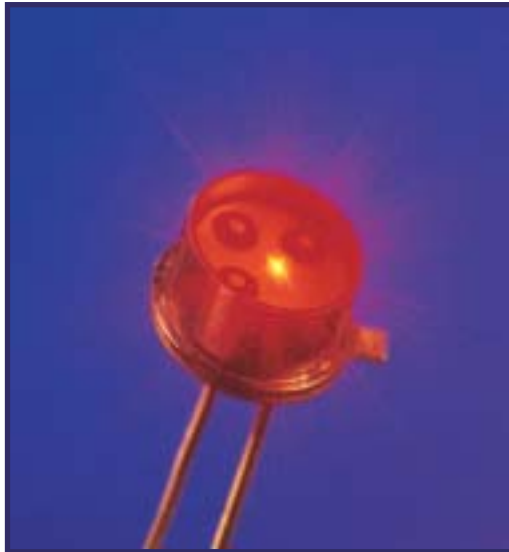
Firecomms' 664nm VCSEL in TO46 Package.

Firecomm's CEO Declan O'Mahoney said that, "We are developing these 650-680 nm VCSEL-based transceivers enabling visible light to run through large core plastic fibre at modulations up to 3.2Gbit/s.